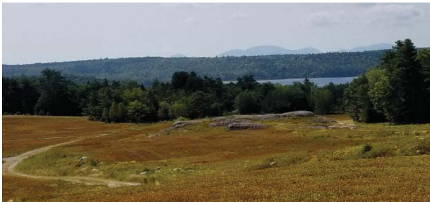
Scene from a recent trail ride in the blueberry barrens

Twin City Speed , 25 Green Point Rd, Brewer, Tel: 989-7344