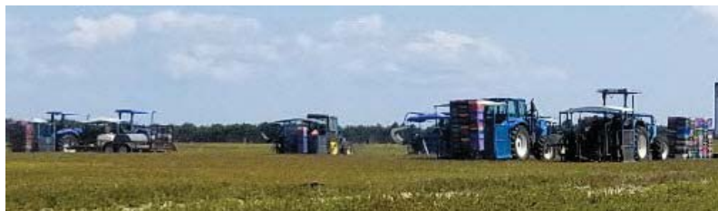
Picking berries next to the trail. We were careful not to get in their way.