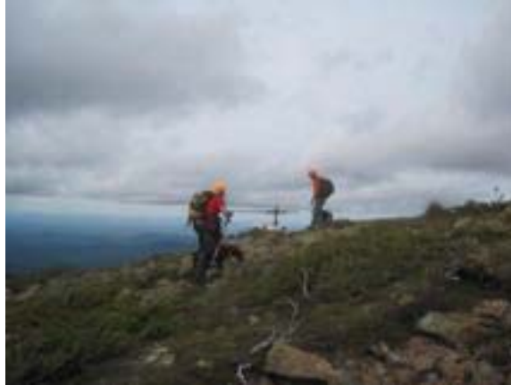
MESARD K9 Team on mountain at Baxter State Park search

http://www.wcsh6.com/story/news/2015/08/29/search-expands--missing-hiker--baxter-state-park/71384058/