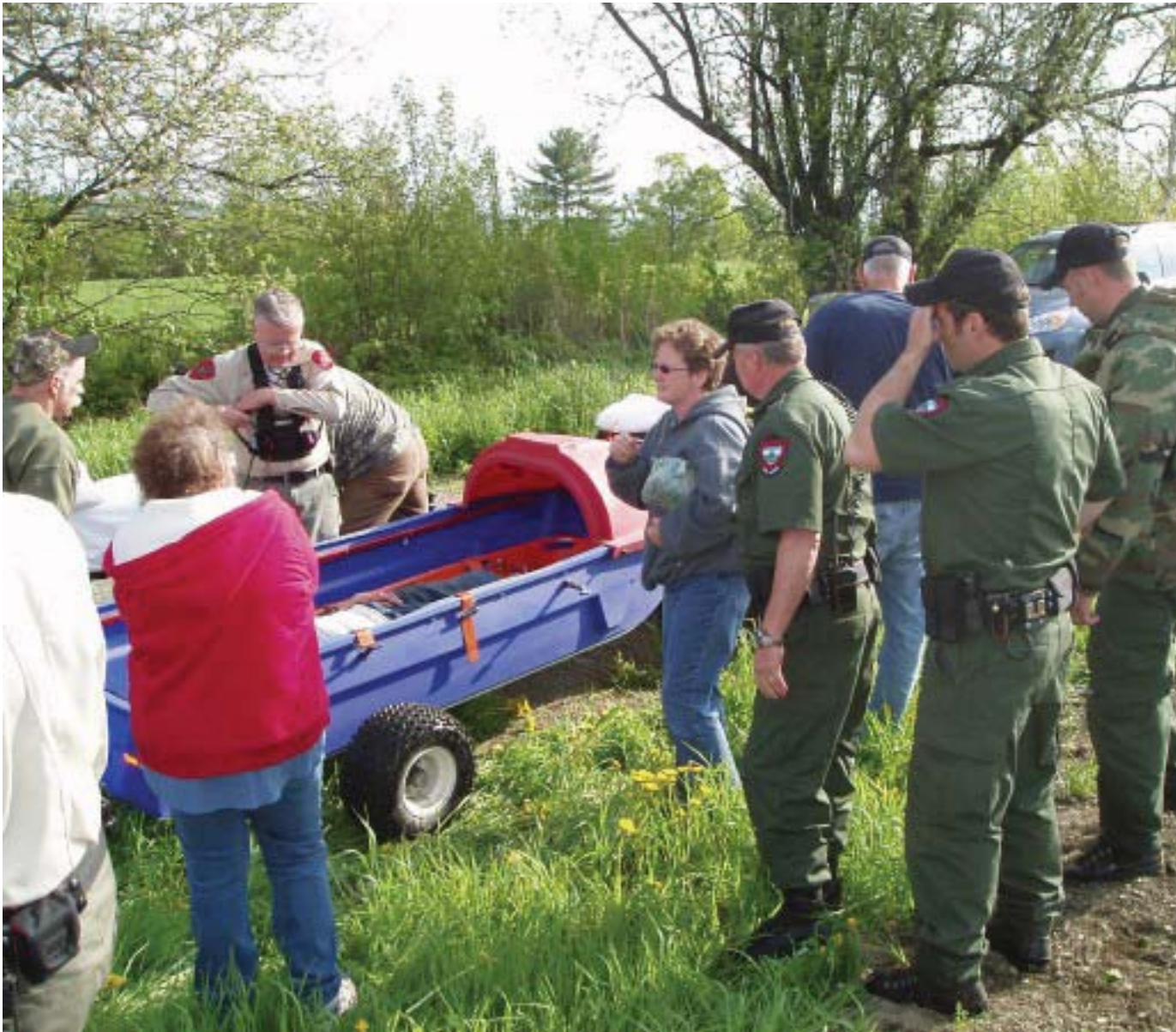
An 85-year-old Harmony woman who was reported missing late Wednesday