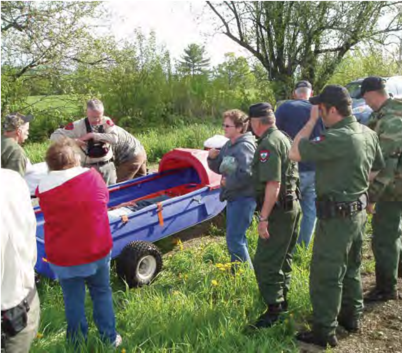
An 85-year-old Harmony woman who was reported missing late Wednesday