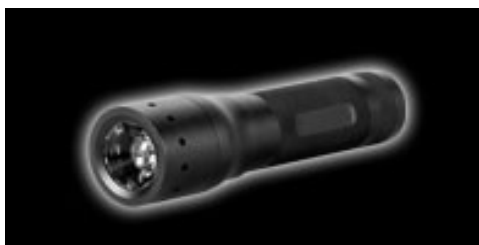
P7 Model 8407